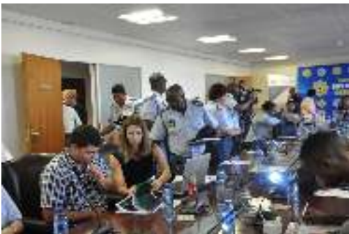
SAPS setting up for presentation