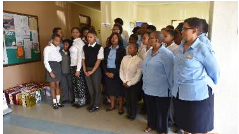
Seen Here: Retlameleng Special School learners and OTP staff