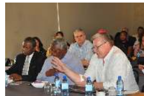
State Law Advisors attending the Interprovincial Forum