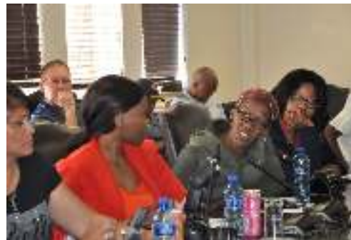
Media in attendance

In conclusion, Premier Lucas commended the South African Police Service for the decrease shown in business related crimes because this shows the situation is not stagnant. There is a decrease in most crimes which have been a concern and although this is good news, we can only be fully satisfied when we can guarantee the complete safety of our communities. Those harbouring criminals are hampering the efforts of our men and women in uniform in creating a safer society for all.