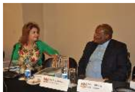
MEC's and government officials from various departments

The 2018 Mid-year Executive Council Lekgotla took place on 23rd October in Kimberley and was focussed on the Economic Development Agenda of government with emphasis on the slow growth of the economy; especially in the Agriculture Sector and the Wage Bill.