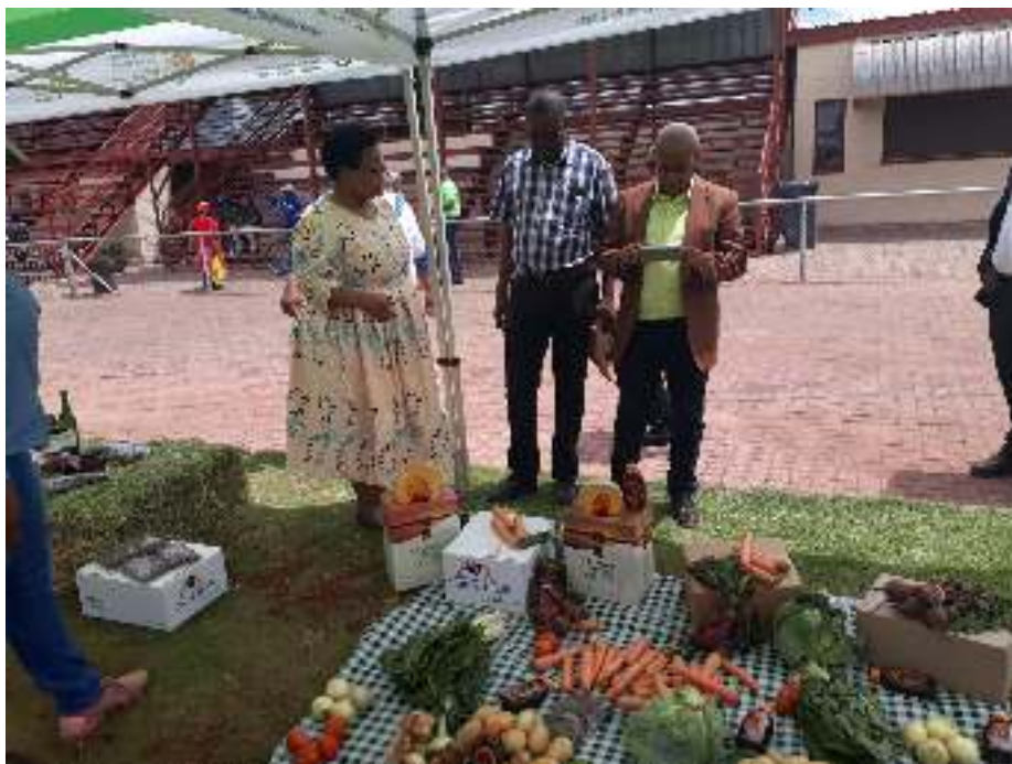
Premier Sylvia Lucas and MEC Norman Shushu

W orld Food Day was commemorated on the 16 October 2018 to observe the plight of millions of people who are undernourished across the globe. The province joined the rest of the world by celebrating this important day under the theme, “Our actions are our future. #A zero hunger world by 2030 is possible.”