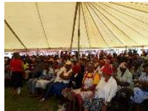
Community members in attendance