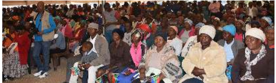
Community members in attendance during the EXCO in JTG

A Second leg of the outreach was allowing community members an opportunity to interact directly with Members of the Executive Council on service delivery challenges and to seek direct intervention from some of the Provincial Government departments. Service delivery departments also delivered services to community members, whilst MECs conducted unannounced visits to service delivery points. Early Childhood Development Centres and schools were supplied with much needed educational toys and sporting equipment.