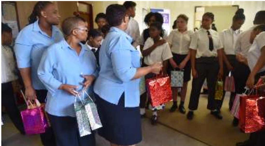
OTP staff hand over sanitary towels